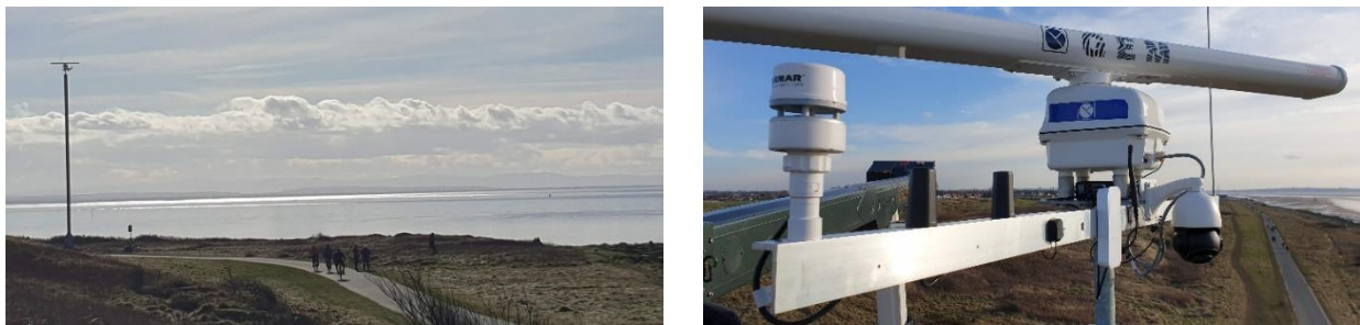
Figure 1: Synoptic 4D system installed at Crosby as part of the NW regional monitoring programme

The main aim of the Synoptic 4D system is to provide coastal managers, engineers and scientists with a cost effective technology that enables the observation of a wide variety of physical parameters and collect data useful to those working in the dynamic coastal environment.