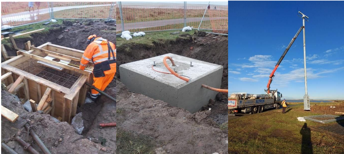
Figure 5: installation process

The process to install a system is reasonably simple, assuming local authorities and coastal managers are key stakeholders and engaged in approving the sites. Planning permission is a requirement for these installations and is currently underway for the North Wirral radar installation. A 3x3 m trench is excavated and a concrete foundation poured, with power provision from a local line. Following this the equipment is installed onto a 12 m bespoke steel column, which is then lifted and bolted to the foundations. The base of the column contains the processing and data recording computer and associated network infrastructure to deliver data back to our processing centre.