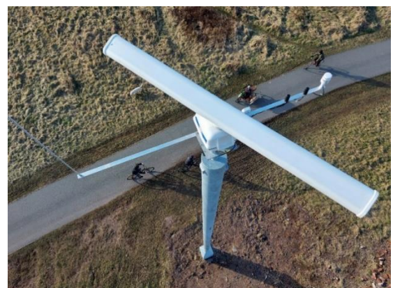
Figure 2: example radar image

The 2.2 m X-band marine radar operates at 9.4 GHz and is extremely well suited to observation of the marine environment. The electromagnetic waves emitted by the antenna have a wavelength of ~3-10 cm, this causes the system to pick up ripples of a similar size on the sea surface very clearly. The system also uses a custom vertically polarised antenna that is more suited to picking up wave crests, than vessels allowing us to better measure wave behaviour and sea surface dynamics. The 15m lighting also hosts a met sensor, AIS (Automatic identification system) verifying ships and 4G antenna for transmitting data back to HQ.