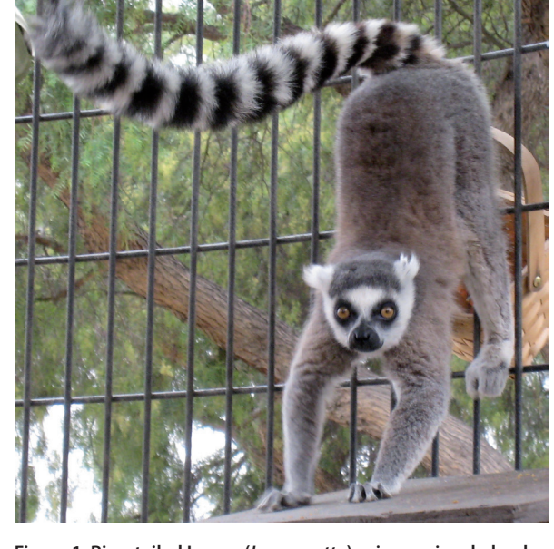
Figure 1. Ring-tailed Lemur (Lemur catta) using perianal glands for scent marking.

In work published recently in BMC Evolutionary Biology, Boulet and colleagues [1] have advanced this field by