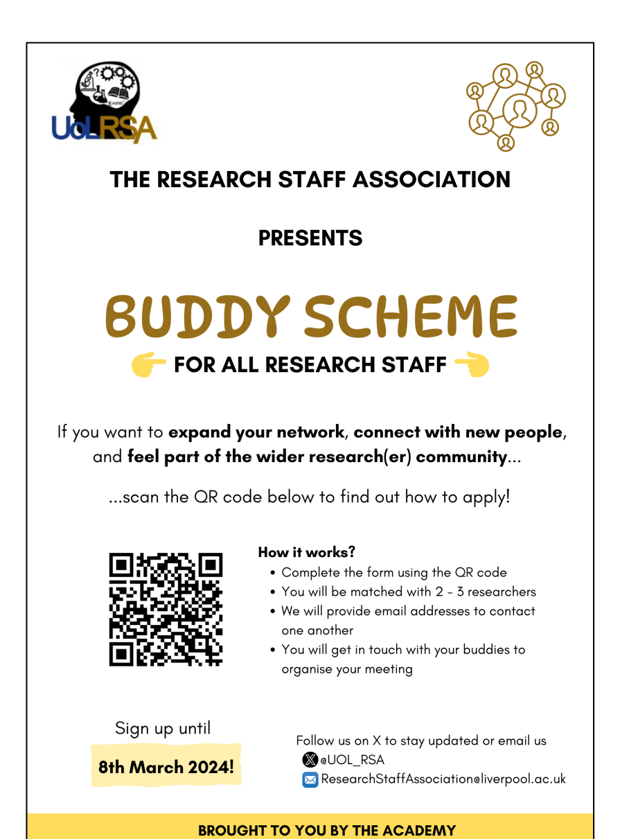
Figure 1. Flyer developed for the fourth round of the Buddy Scheme and posted around the faculties and the University Campus.