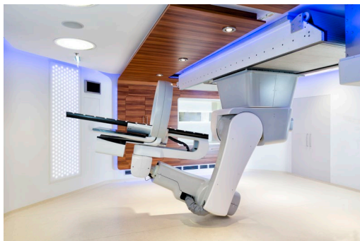
Treatment room at MedAustron.

The analyses already show that patients with head tumors, for example, retain their neurocognitive performance and resilience after completing their therapy. This includes visual-motor coordination, verbal short-term memory, and word fluency. Tumor control in very complex cases is also promising. In that group of patients whose brain tumors recurred after previous other irradiations and who were irradiated with protons at MedAustron, late effects occurred in less than 10% of those affected. Tumor control, i.e. the absence of new tumor growth, was 87% after two years (example meningiomas).