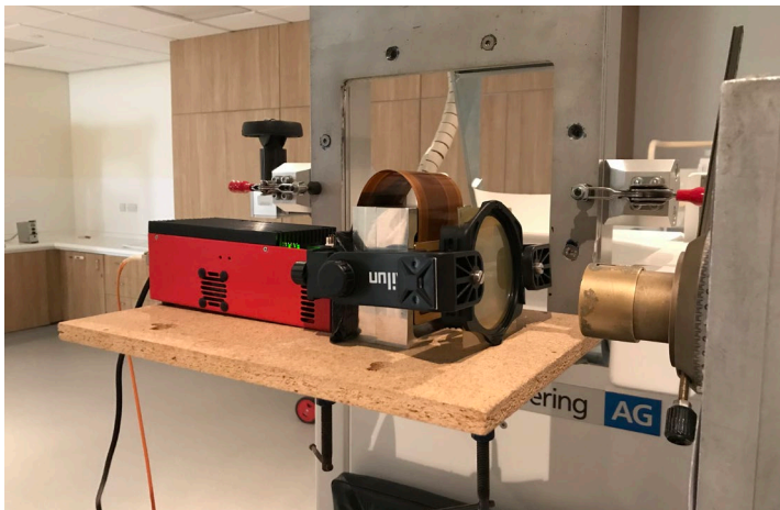
Experimental setup for the Medipix3 measurements.