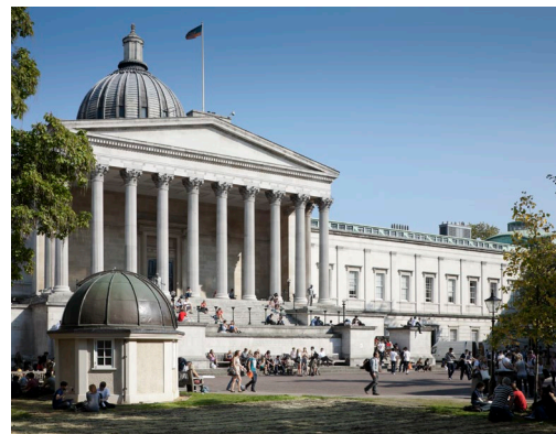
Campus of University College London