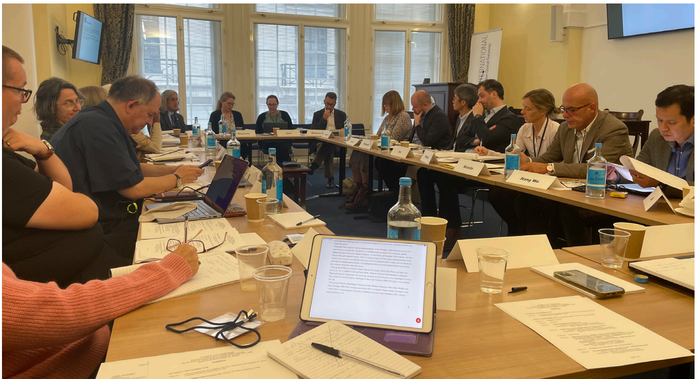
CLPU members and other participants at the Charity Law Workshop.

A full list of Unit presentations can be found on the CLPU website .