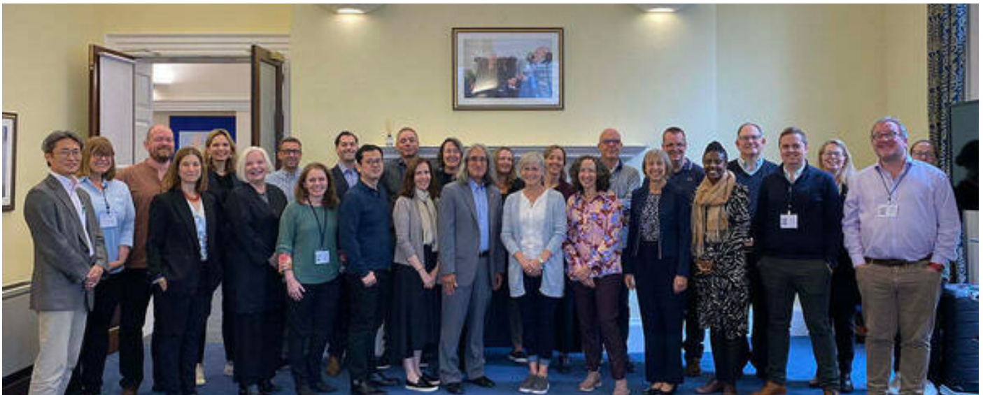
2022 Charity Law Workshop, University of Notre Dame (US) London Global Gateway.

The Network has developed a website and a related newsletter to keep participants informed about important charity law scholarly developments. It is planning another gathering in 2024.