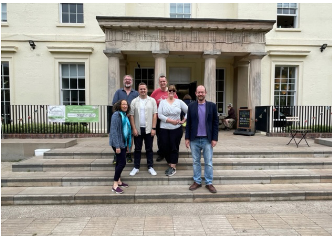
CLPU members outside the Reader, Calderstones Park, Liverpool, during a recent research away day.