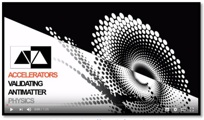
Watch the video: <a href="https://youtu.be/m6NWbzBUFaU">https://youtu.be/m6NWbzBUFaU</a>

http://www.ava-project.eu and in the AVA video: https://youtu.be/m6NWbzBUFaU