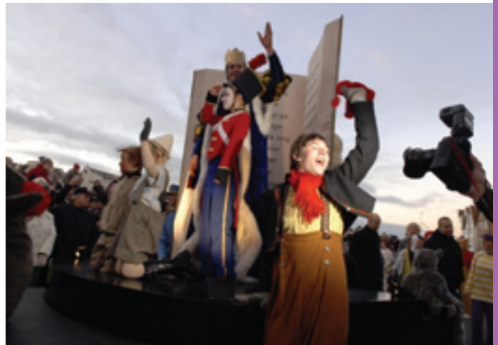
Stavanger opening parade.