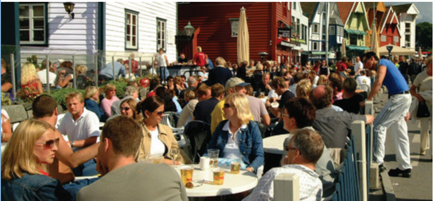
Stavanger Vagen – the city harbour

A further potential element of a future project identified in the Group's discussions is the exploration of the specific opportunities and challenges of ECoCs from the new Member States 15 and how they can better share their experiences and learn from each other.