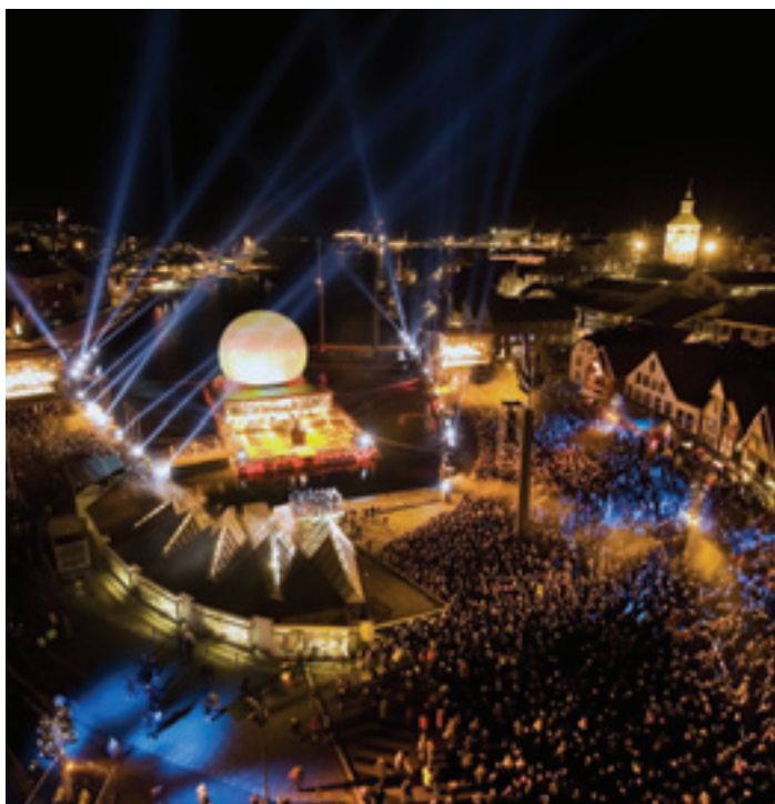
Closing ceremony for Stavanger2008 in December