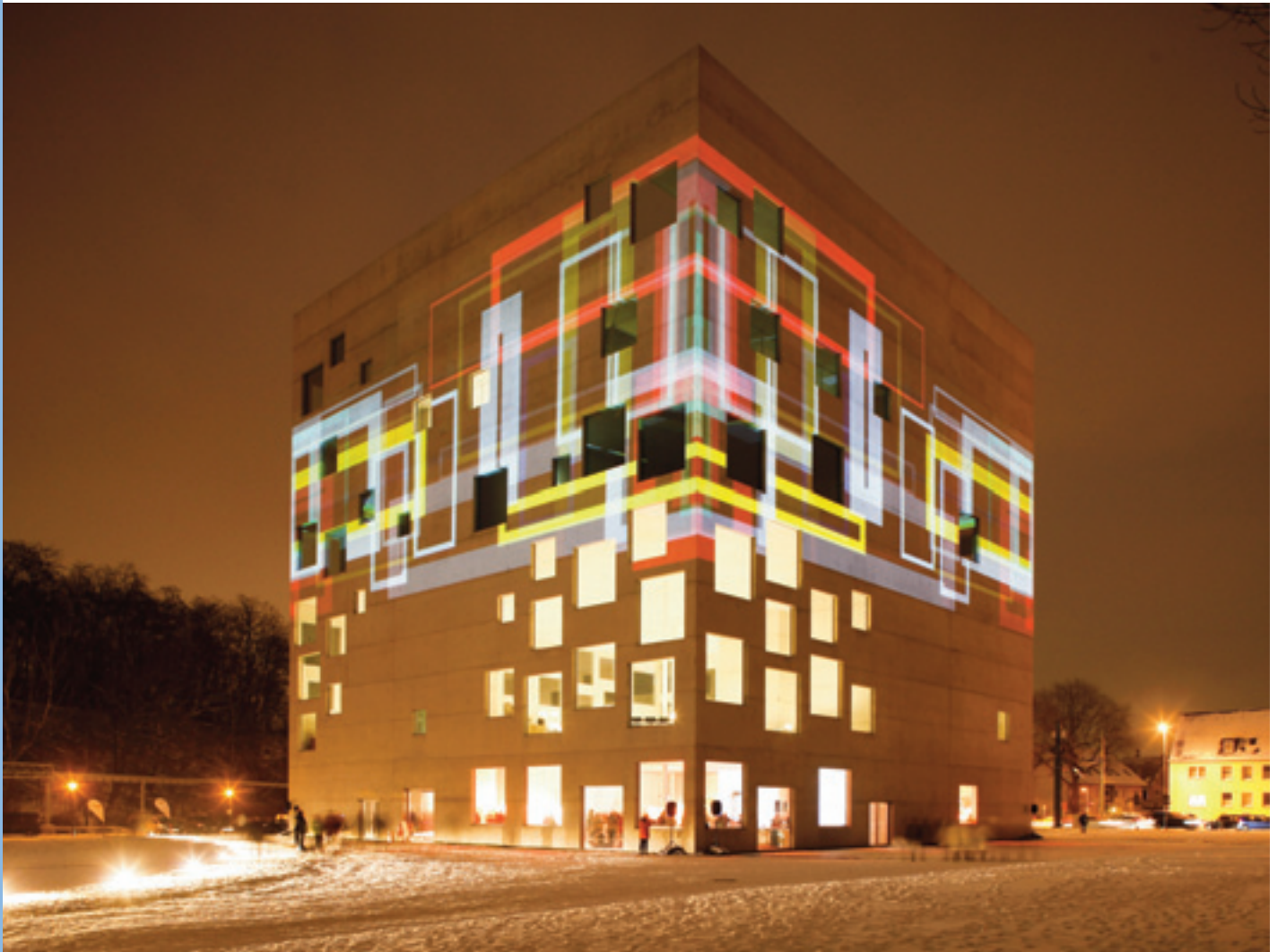
“close encounter” von Joeressen+Kessner, SANAA-Gebäude, Foto: RUHR.2010/Rupert Oberhäuser