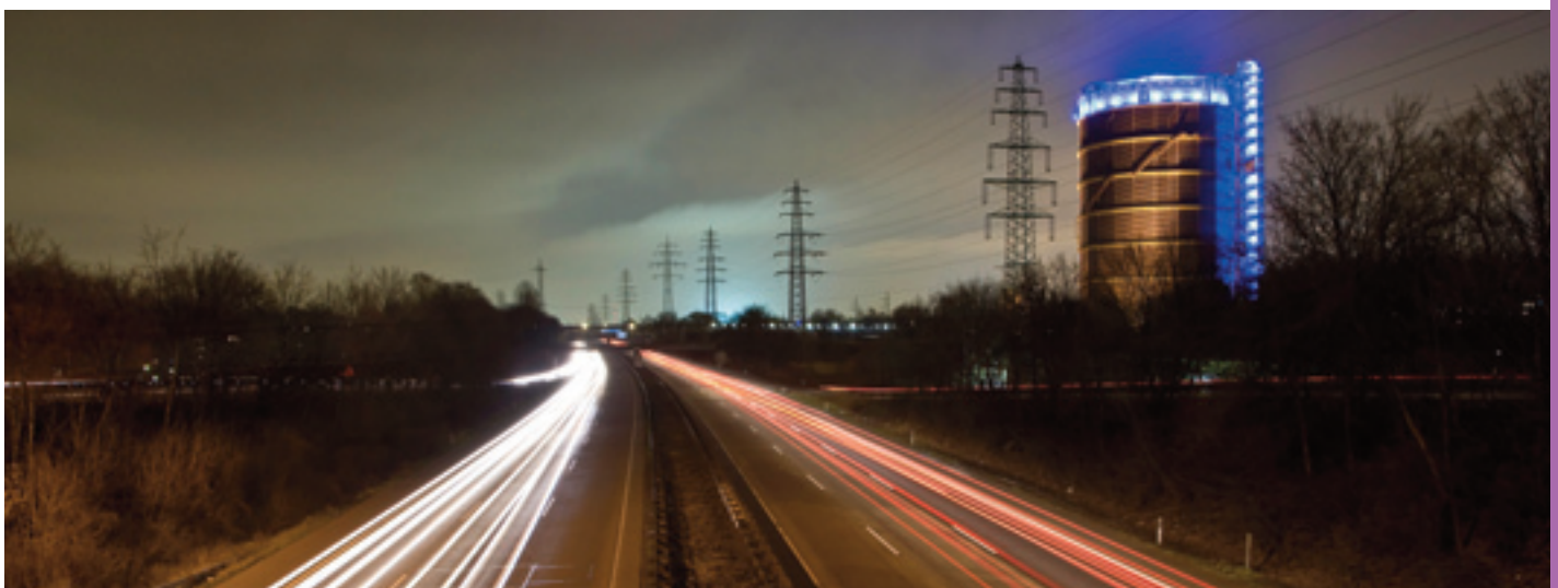
Gasometer Oberhausen

A final case study report, published end of July 2010, also sets out some key recommendations for policy makers and some lessons for those cities developing their bids and their programmes. This may also be useful for other organisations who are delivering major cultural or other events. The ECoC experience has provided an opportunity for a number of major cities to refresh, reposition and reinvent themselves with culture at the heart of this process. The case study work may therefore contribute to broader analyses of cultural governance and the impact of culture on city development.