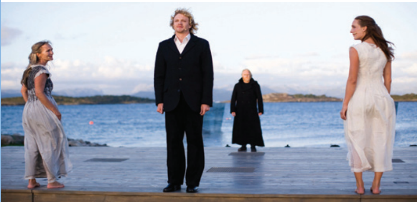
The City Harbour Actors from the Stavanger2008 play Fairytales in Landscape