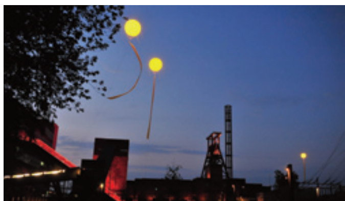
SchachtZeichen, UNESCO Welterbe Zollverein, Essen, Foto: RUHR.2010/Manfred Vollmer

A low cost way of producing a holistic research programme could be to supplement a funded core monitoring and evaluation programme with non-directly funded research within local Universities and research institutes. These external research projects could be mapped against the six themes of the framework proposed later in this report. It would then be essential to bring the findings of all these elements together in a final summary report.