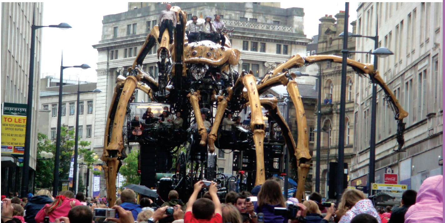
La Princesse (designed and operated by La Machine, brought to the UK by Artichoke) tours Liverpool City Centre, watched by 400,000 onlookers.