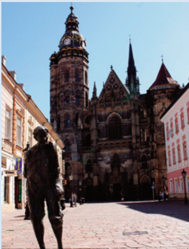
By Kosice 2013

Prior to setting up a research and evaluation programme, ECoCs will need to ensure proper awareness of previously completed studies. The consultation and familiarisation with existing literature and documentary reviews of local, national and international sources will help achieve this. This familiarisation of existing literature reviews should be followed by an extensive data mapping exercise which can be conducted by the research team, once it has been installed, will allow the identification of relevant gaps in the research and information available and assist in the prioritisation of methodologies and specific research projects required in order to demonstrate impact across the thematic clusters (see section C). From then on, the approach to gathering and analysing data should be distributed across three main areas: ongoing collation and analysis of secondary data, collecting benchmark indicators and additional primary data gathering.