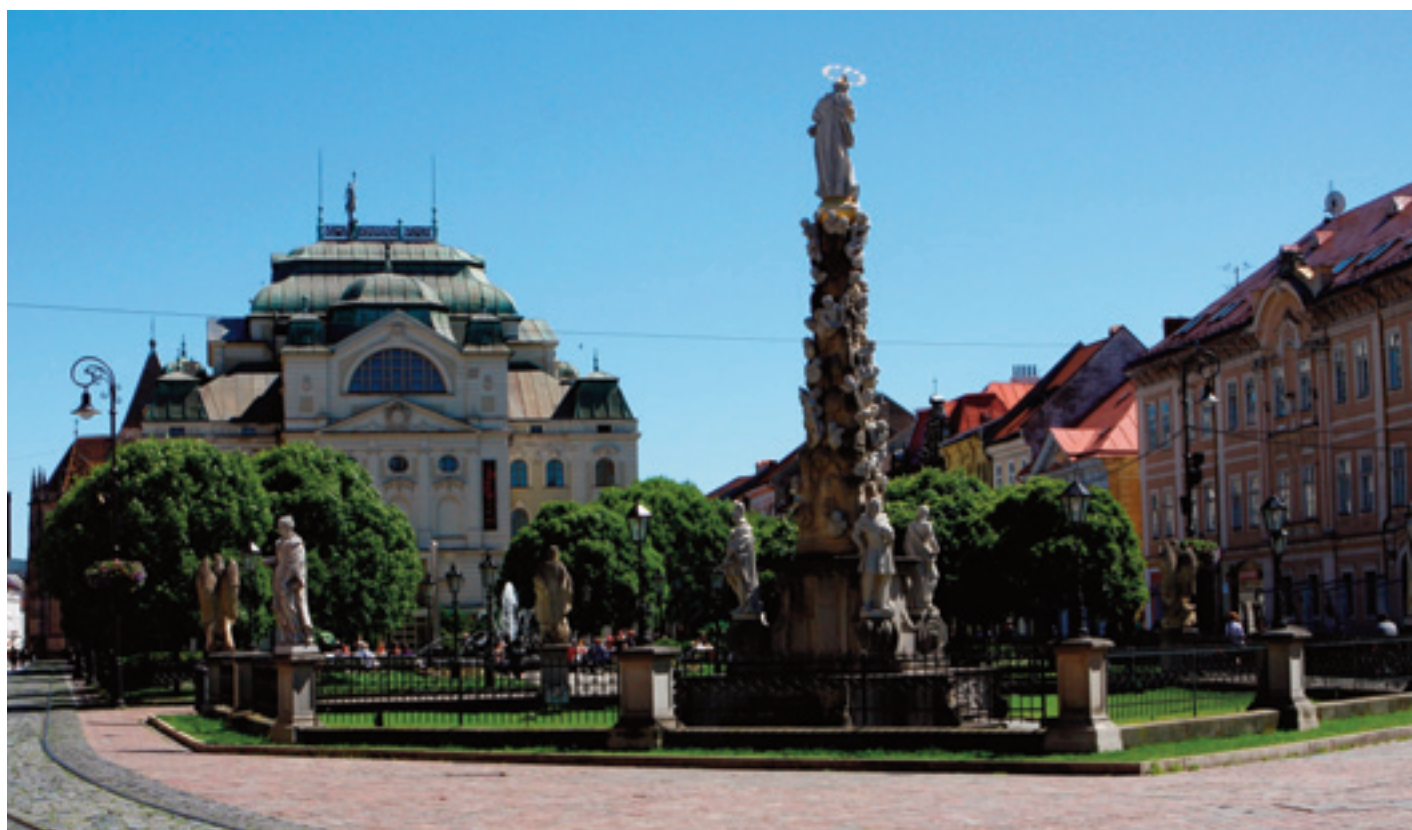
By Carl Pearson, Kosice

In developing a model for impact assessment, it must be acknowledged that ECoC programmes are not discrete events but elements in an ongoing process. As such, it is as important to look at intermediate effects, such as why and how activities are carried out and how participation is sought and achieved, as it is to look at final outcomes. The full effects of a major cultural event are often not felt for several decades. For this reason, a sustainable research programme should complement the assessment of outcomes and outputs with the study of processes from the bid stage onwards.