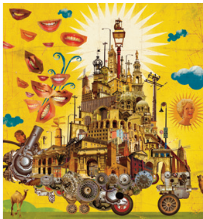
"La cité radieuse" (The radiant city) as represented by Stephan Muntaner

By 2009 the European Commission had not imposed any particular set of regulations on ECoCs' evaluation, monitoring and research approaches. As a result, available assessments of past ECoCs were extremely diverse and, often, difficult to compare. The establishment of a replicable framework for research was, therefore, the aim of the Policy Group.