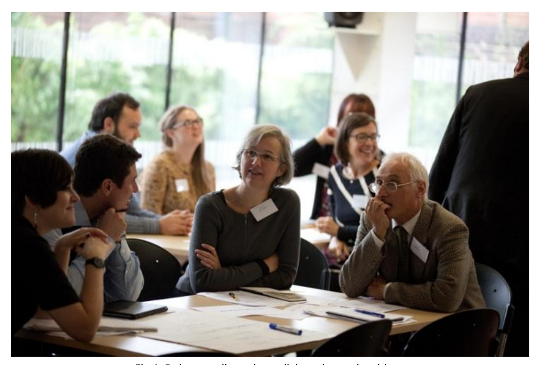
Fig 1. Delegates discussing collaborative project ideas.

The second of the four workshops in the 'New Thinking from the North' N8 partnership project took place at the University of Sheffield's Humanities Research Institute on 19 September 2013. The initiative aims to identify the ways in which academics and practitioners in arts and humanities can collaborate with local authorities and communities to help drive economic growth in the North