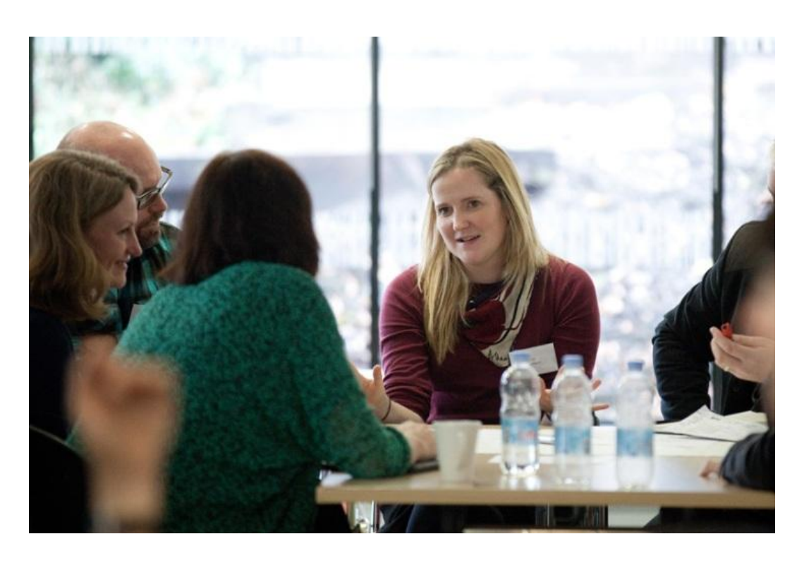
Fig 6: Small group discussions of potential collaboration topics.

Small group discussions involving delegates took place at the end of each session around the three themes presented. These were presented at a final plenary session. Ideas discussed included the potential for combining the Rebellious North theme with Tracing and Understanding Keywords to explore links between keywords and space. By plotting dialect and concentrations of usages in texts, visual representation of frequencies could be mapped on to the landscape which would enhance understanding of this theme. Rebellious North provoked discussion, amongst other things, about the nature of rebellion and the geographical boundaries of 'the north' as well as the methods or epistemologies that might provide a focus for this theme.