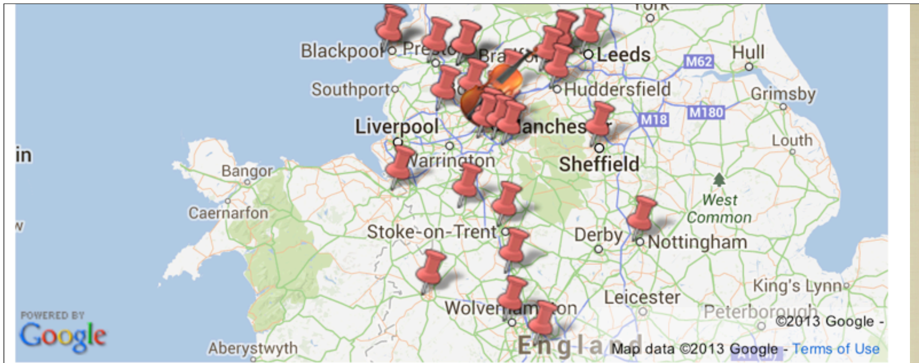
Longford Cinema, Stretford.