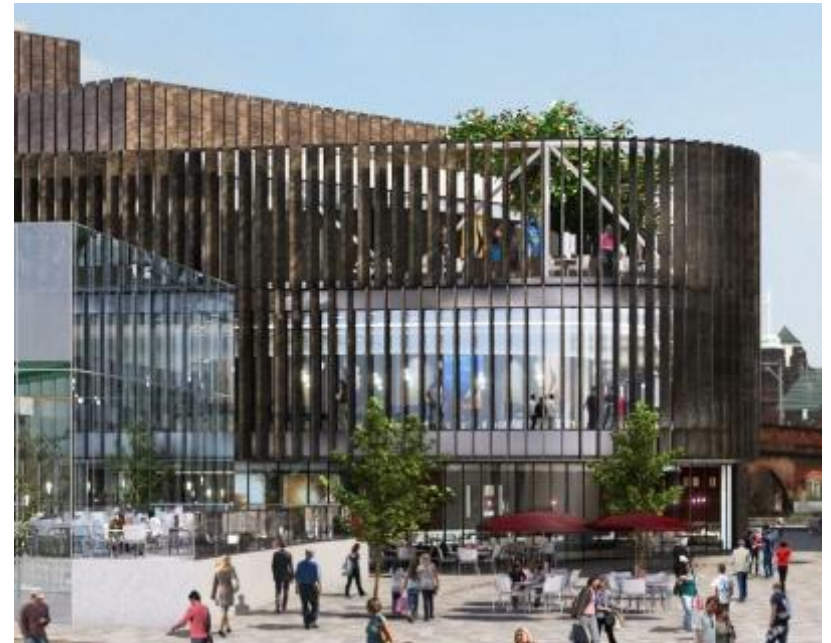
HOME, the new venue for Cornerhouse and Library Theatre, Manchester. Opening early 2015.