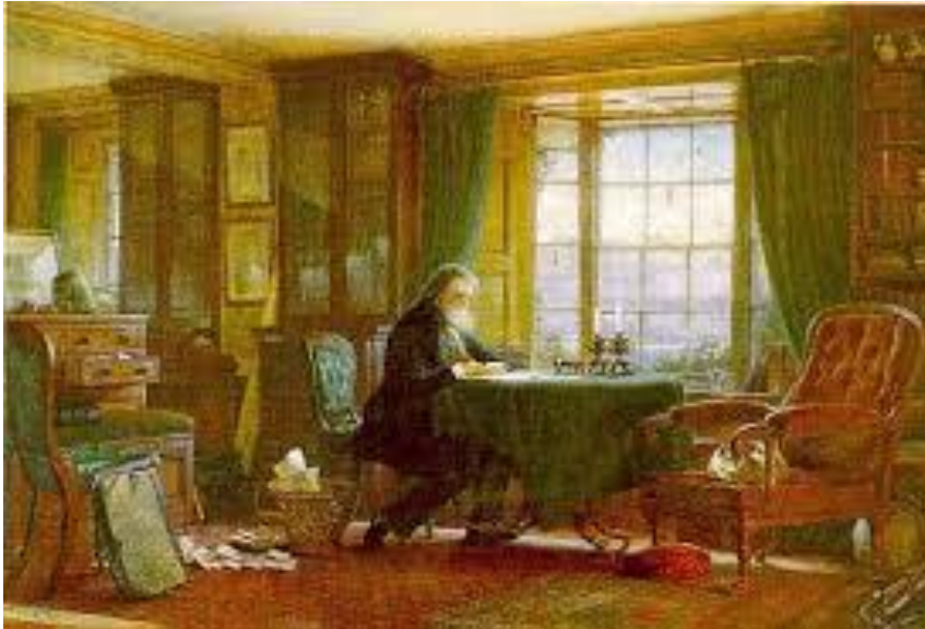
John Ruskin in his Study at Brantwood, W.G.Collingwood, 1882