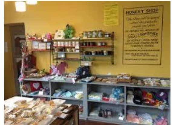
Coniston village and the Coniston Institute, Cumbria