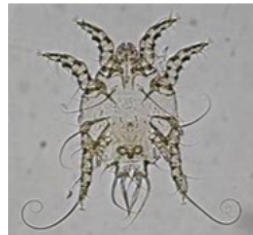
Chorioptic mite under the microscope at 0.3mm long. If you can see it, its probably not a chorioptic mite!