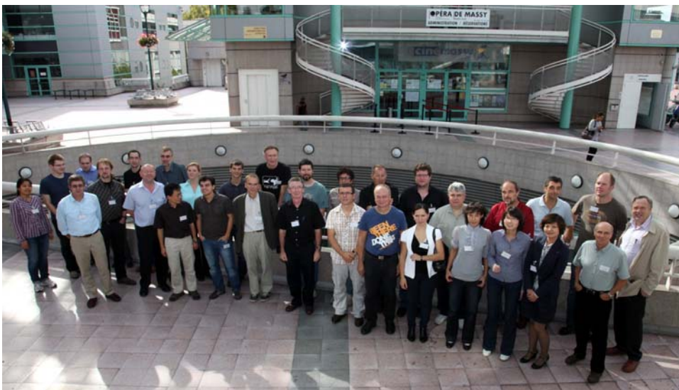
Group photo of the 4 th DITANET workshop on High Intensity Proton Beam Diagnostics, Massy