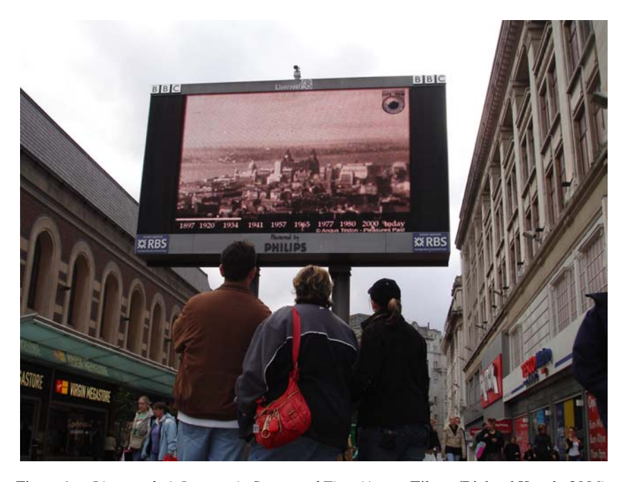
Figure 1. Liverpool: A Journey in Space and Time (Angus Tilston/Richard Koeck, 2006), BBC Big Screen, Liverpool, November 2006.

It was however the return of filmmaker Terence Davies to the city of his birth to make a digital film largely composed of fragments of archive footage